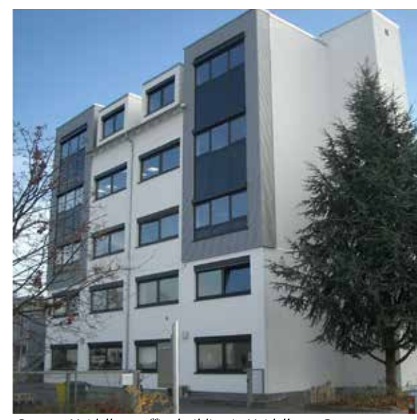
Concept Heidelberg office building in Heidelberg, Germany

As Europe's leading advanced training and information services provider in the area of pharmaceutical quality assurance and drug safety (Good Manufacturing Practices and Good Distribution Practices) Concept Heidelberg develops and organises more than 280 seminars and conferences in 10 European countries.