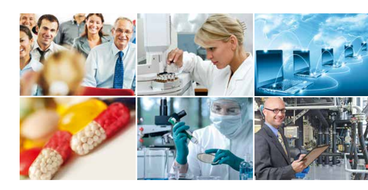
Pharmaceutical Quality Training. Conferences. Services.