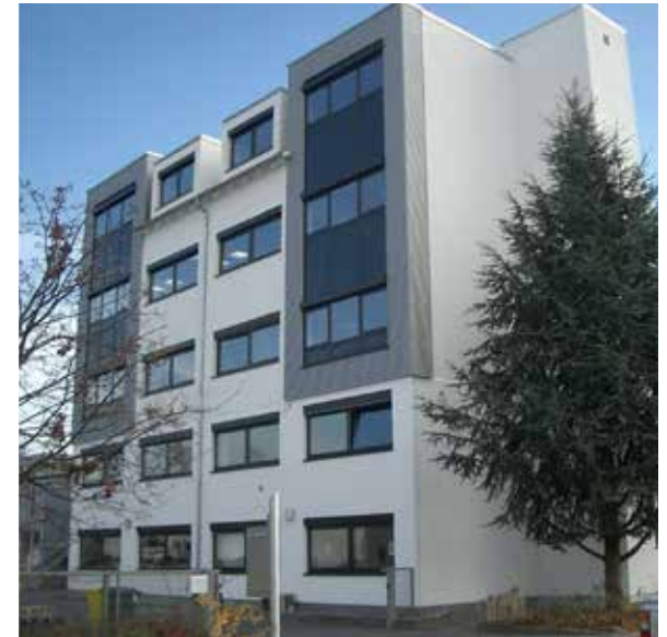
Concept Heidelberg office building in Heidelberg, Germany

For more information, please visit the website www.concept-heidelberg.com